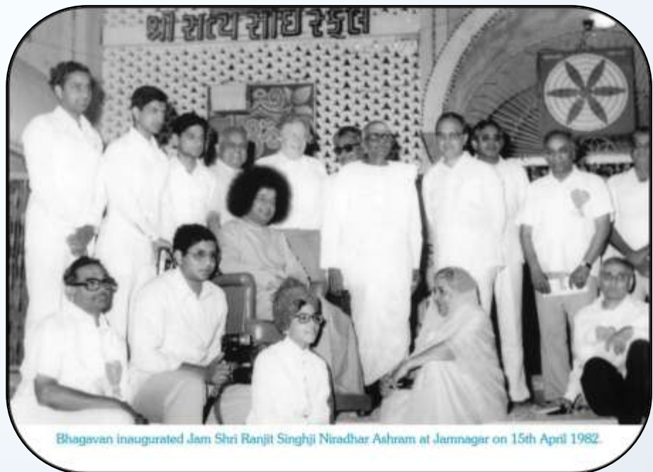
Bhagavan inaugurated Jam Shri Ranjit Singhji Niradhar Ashram at Jamnagar on 15th April 1982.