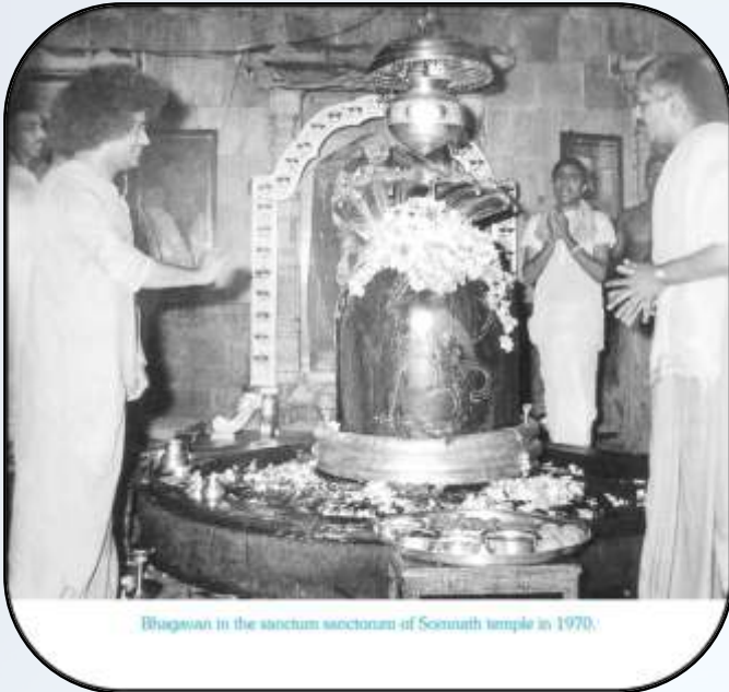
Bhagavan in the sanctum sanctorum of Somnath temple in 1970.

Vinayaka idol for Prof. V. K. Gokak and a beautiful silver idol of Annapurna for the Principal of the Sainik School.