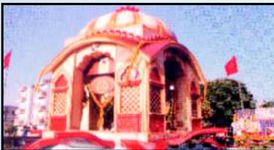
Sri Sathya Sai Circle, Vadodara