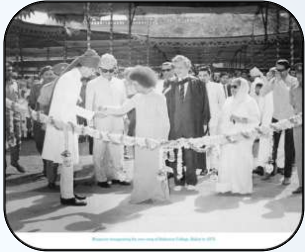
Swami inaugurating Sri Bal Vikas Building, Sainik School