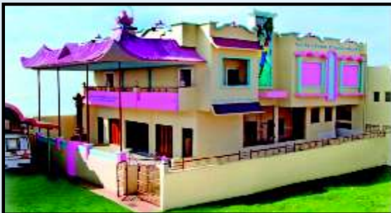
Sri Sai Avtar Pradarshini, Navsari