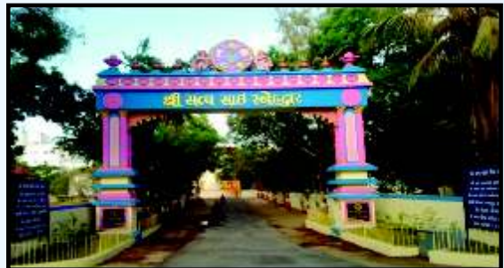
Sri Sathya Sai Sneh Dwar, Navsari