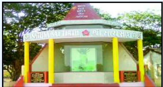
Sri Sathya Sai Tirth, Wagaldhara