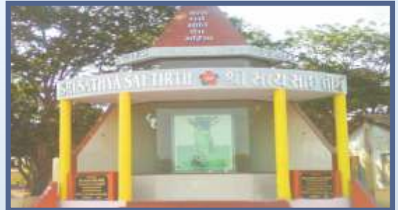
Sri Sathya Sai Tirth, Wagaldhara