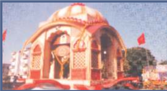
Sri Sathya Sai Circle, Vadodara