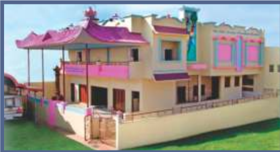
Sri Sai Avtar Pradarshini, Navsari