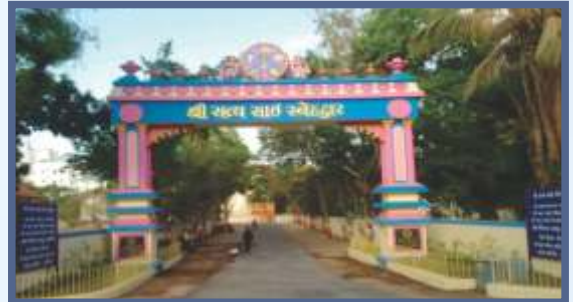
Sri Sathya Sai Sneh Dwar, Navsari